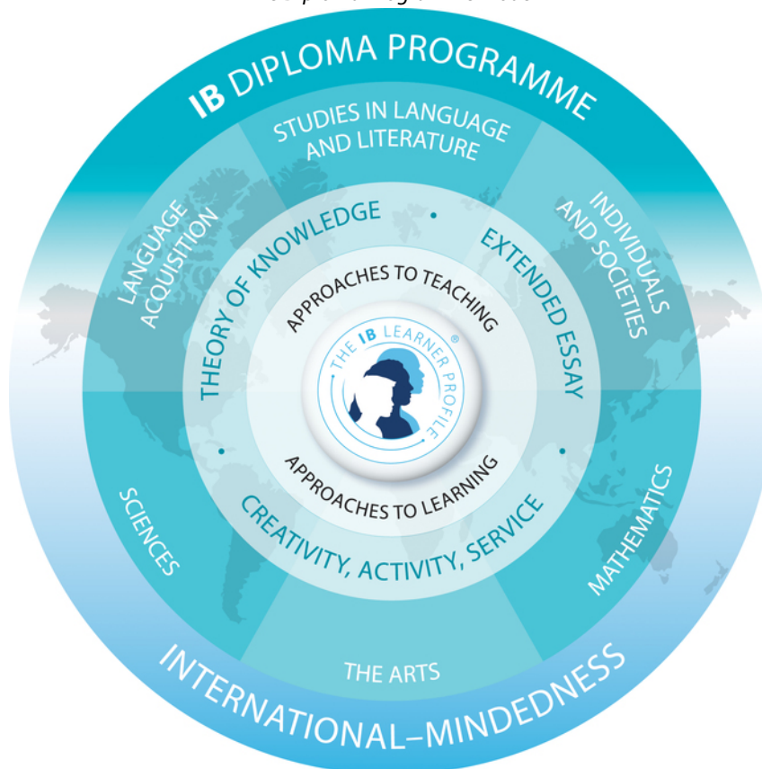
The Diploma Programme model